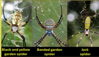
Black and yellow garden spider