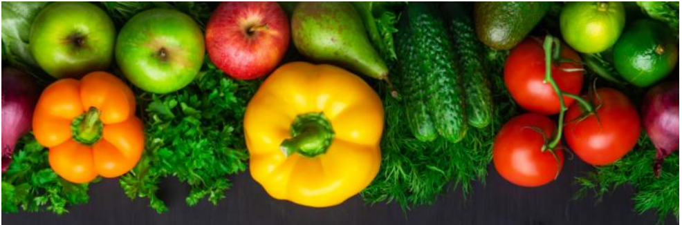
Exhibit Hall Classes Available online at Cartercountyfair.org

Exhibit Hall Open Tuesday-Friday from 6:00-8:00