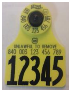
Figure 3: Example of an Official Tag