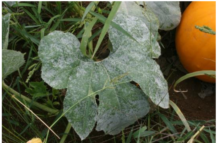
Figure 1: Cucurbit powdery mildew symptoms begin as white, powdery spots on upper or lower leaf surfaces.

For additional information contact the Extension Office.