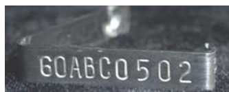
Figure 2: National Uniform Eartagging System (NUES) Metal Tag (“Silver” or “Brite” Tag).

No, all visual-only official ID tags applied prior to the date the rule is effective will be considered official identification for the animal’s lifetime including the metal NUES tags (Figure 2), commonly referred to as “silver” or “brite” tags, and the Brucellosis Vaccination metal tag, an orange metal tag that indicates the animal was calfhood vaccinated for Brucellosis (Bangs Disease). However, a visually and electronically readable official eartag may be applied to animals currently identified with non-EID official eartags or Brucellosis vaccination tags, even though this results in more than one official eartag in an individual animal (page 102).